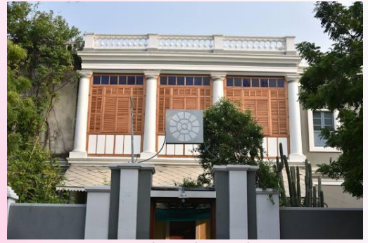
Sri Aurobindo Ashram