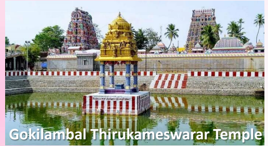
Gokilambal Thirukameswarar Temple