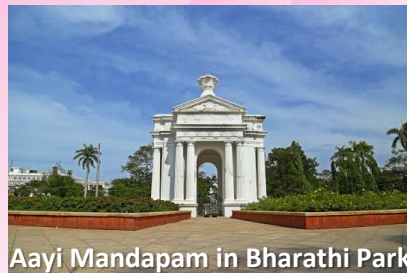
Aayi Mandapam in Bharathi Park