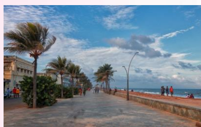
Sea side Promenade