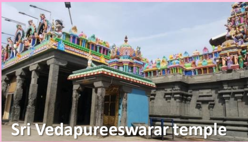
Sri Vedapureswarar temple