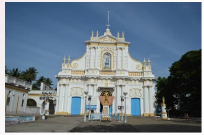
Immaculate Conception Cathedral