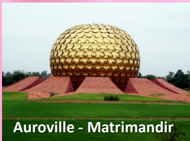
Auroville - Matrimandir