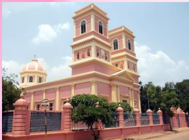
Church of Our Lady of Angels