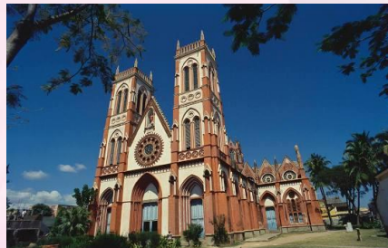
Basilica of the Sacred Heart of Jesus