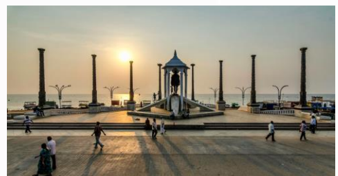
Gandhi statue in Promenade beach